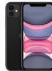
iPhone 11(3110mAh) about 8.6 times