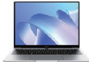
HuaWei MateBook 14 (65W) about 2 hours