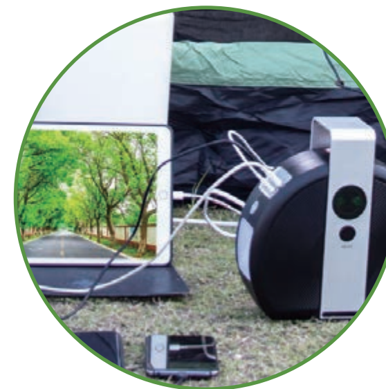
TYPE C Output