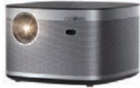
45W Projector about 3 hours

42000 \times 0.85 \times 0.75 / \text{Device Battery Capacity} = \text{Charing times} . For example, Iphone11 (3110mAh): 42000 \times 0.85 \times 0.75 / 3110 \approx 12.3 (times)