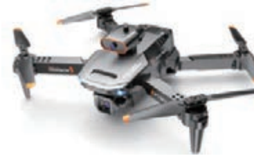
Unmanned Aerial Vehicle(2250mAh) about 12 times