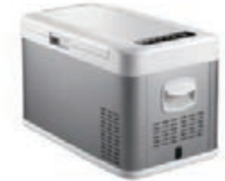
DC Car Refrigerator (60W) about 2.3 hours