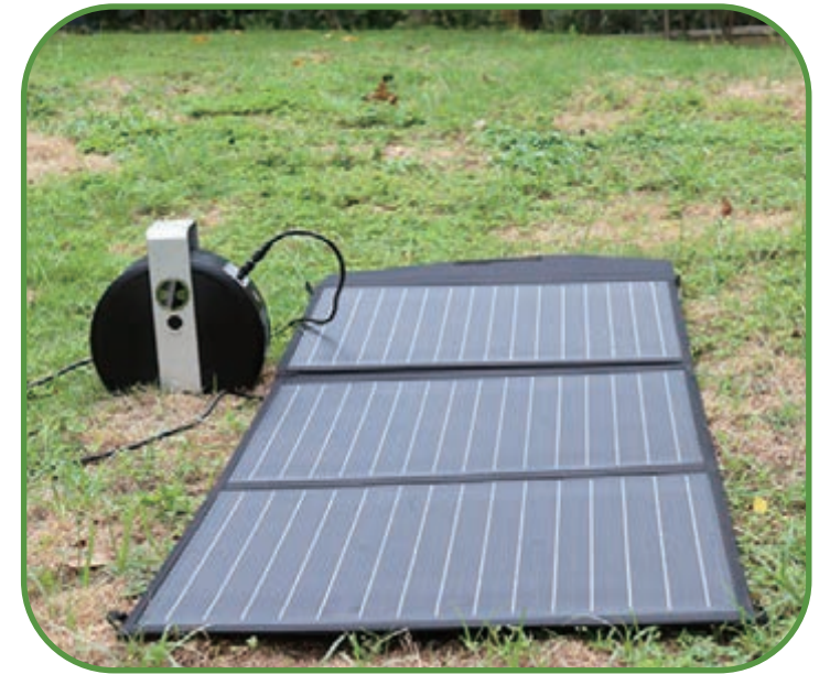
Solar panel charging