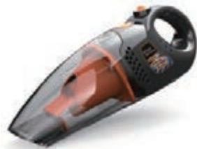
Car Cleaner(45W) about 3 hours