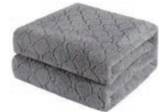
Electric Blanket (60W) about 2.3 hours

The above dataes are obtained from laboratory tests, and the actual use will vary slightly depending on the specific situation.