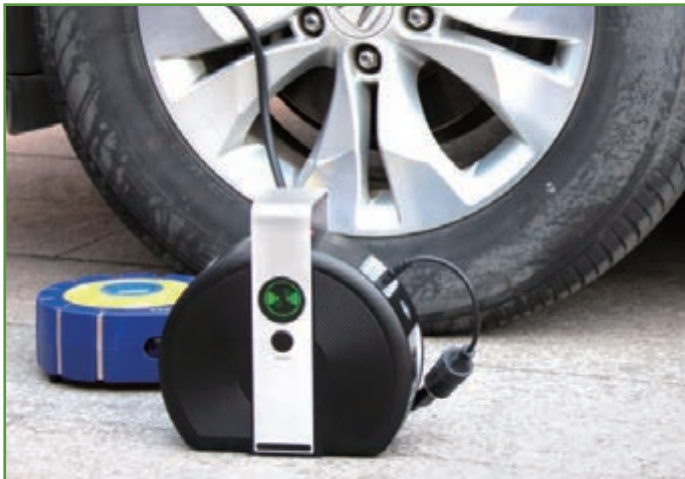
Car Air Pump