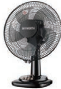
50W Fan about 2.6 hours